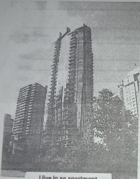
I live in an apartment.