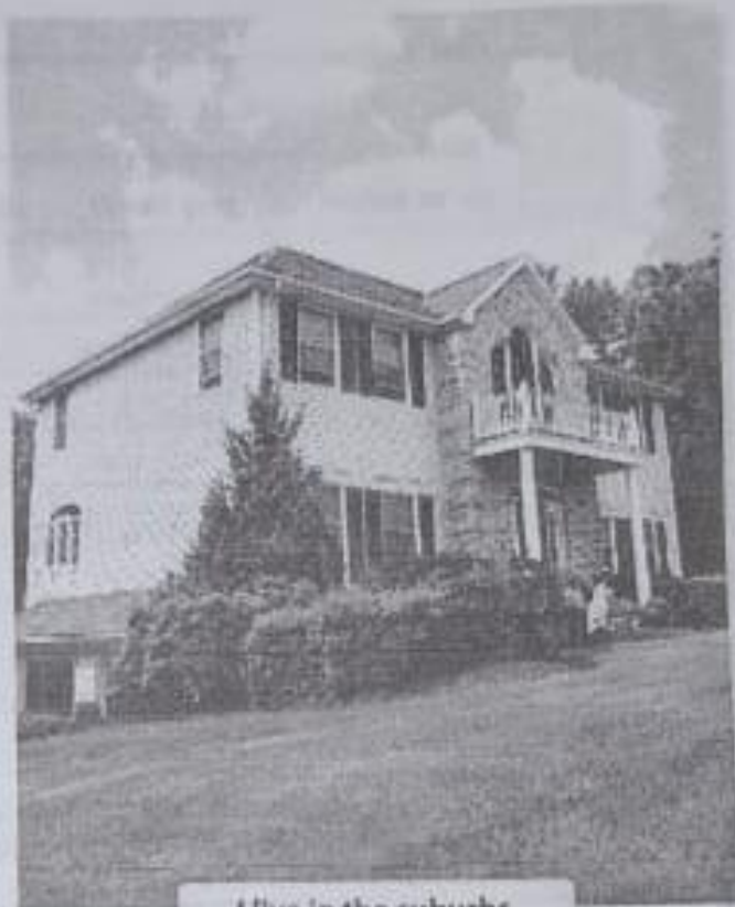
I live in the suburbs.

B Correct the false statements in part A.