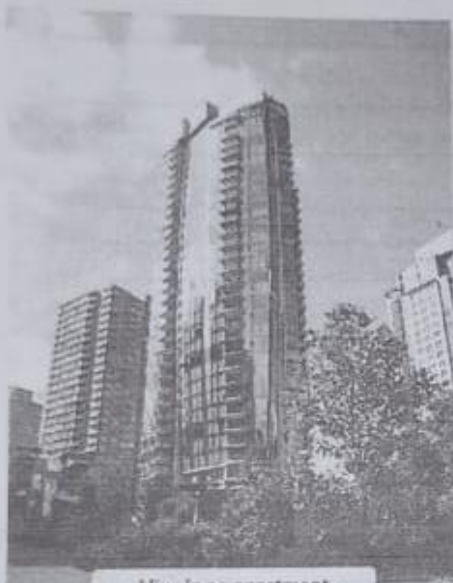
I live in an apartment.