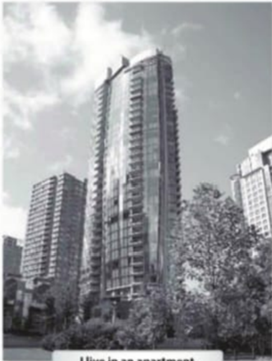
I live in an apartment.