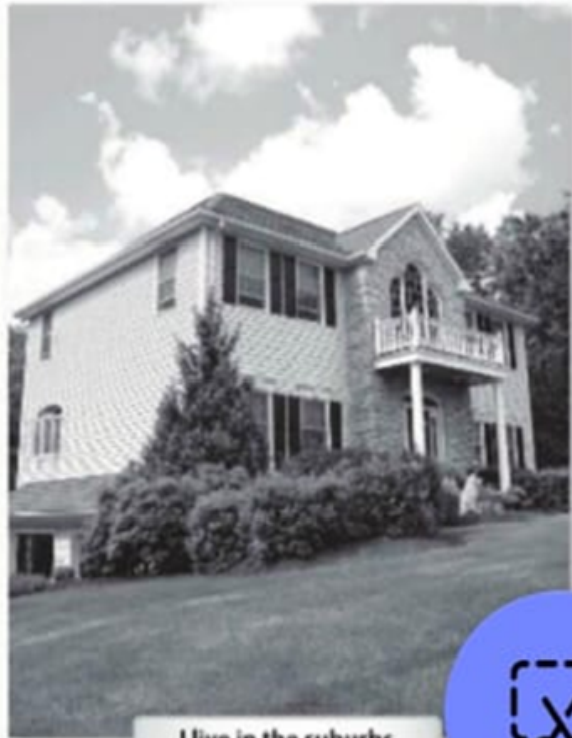
I live in the suburbs.