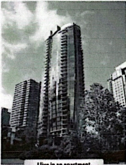
I live in an apartment.