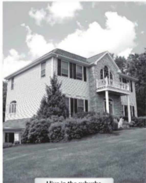
I live in the suburbs.

B Correct the false statements in part A.