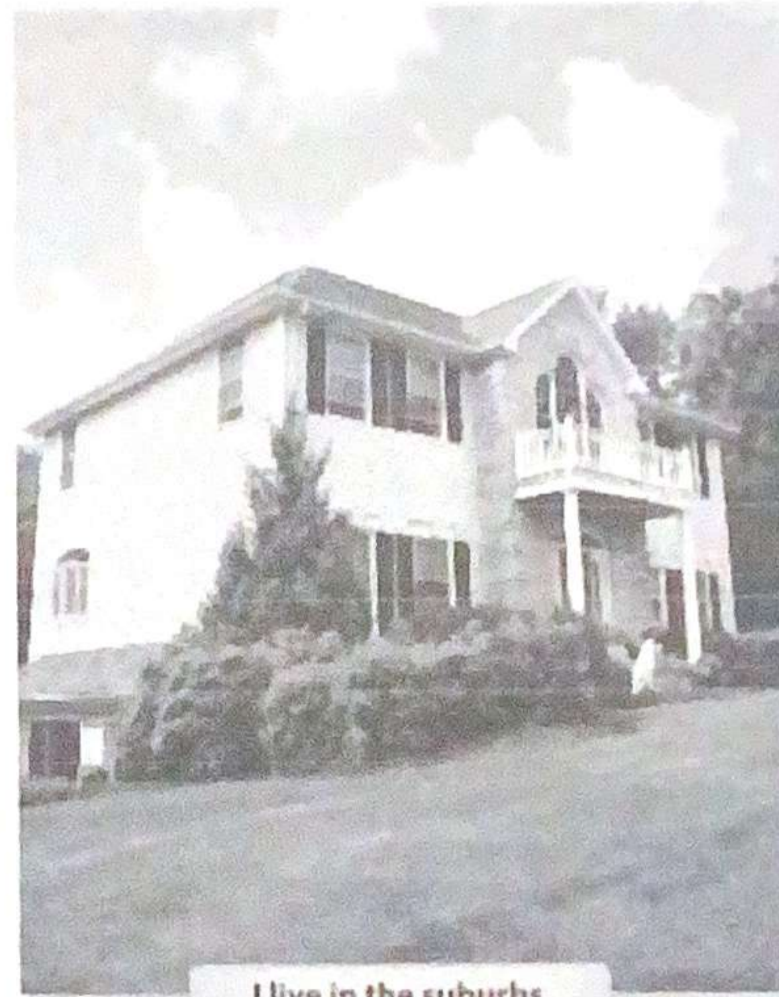
I live in the suburbs.

B Correct the false statements in part A.