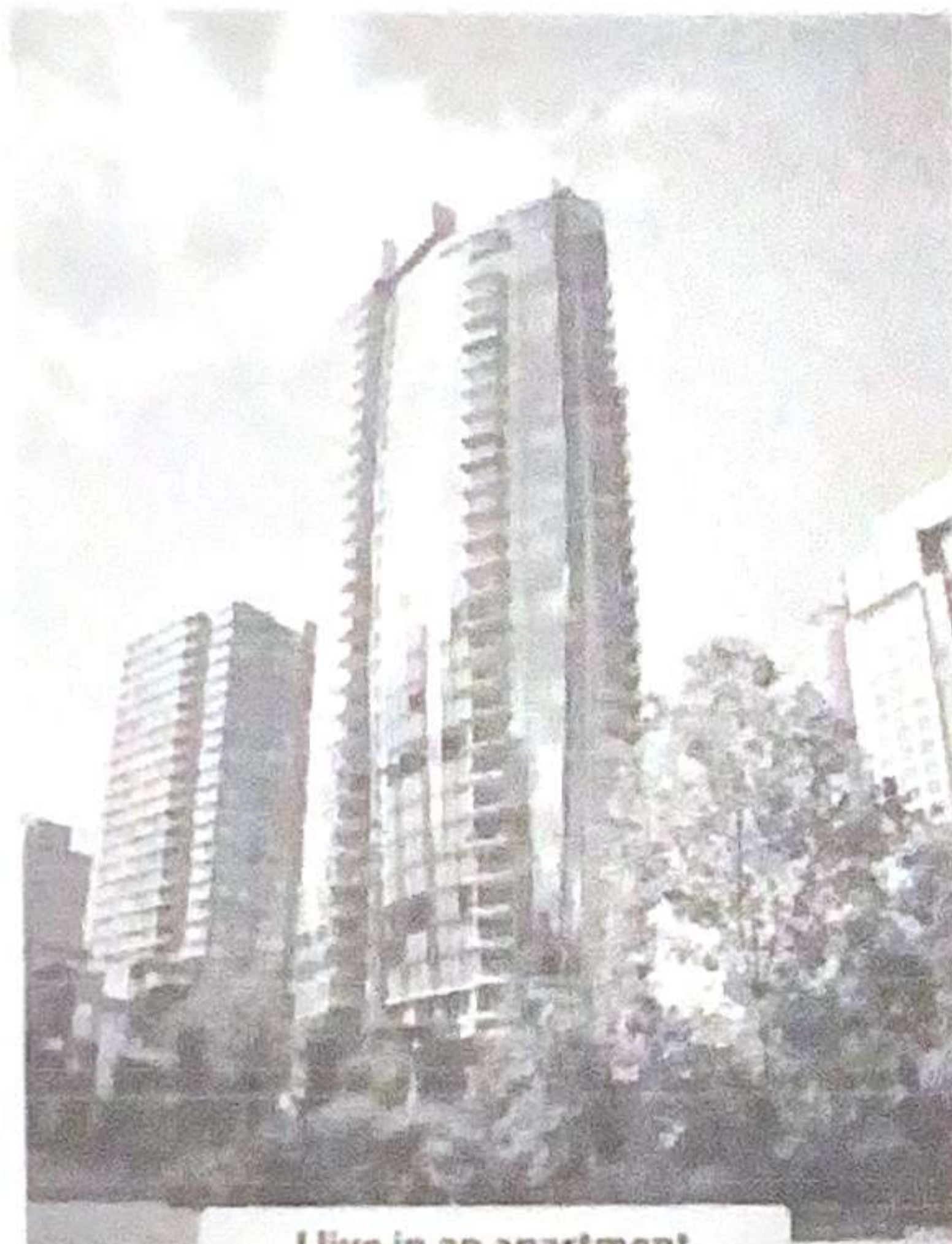
I live in an apartment.