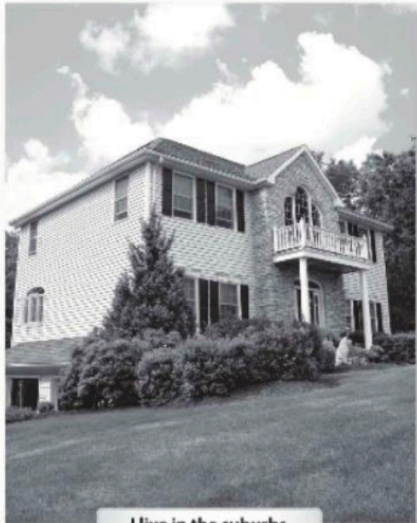
I live in the suburbs.

B Correct the false statements in part A.