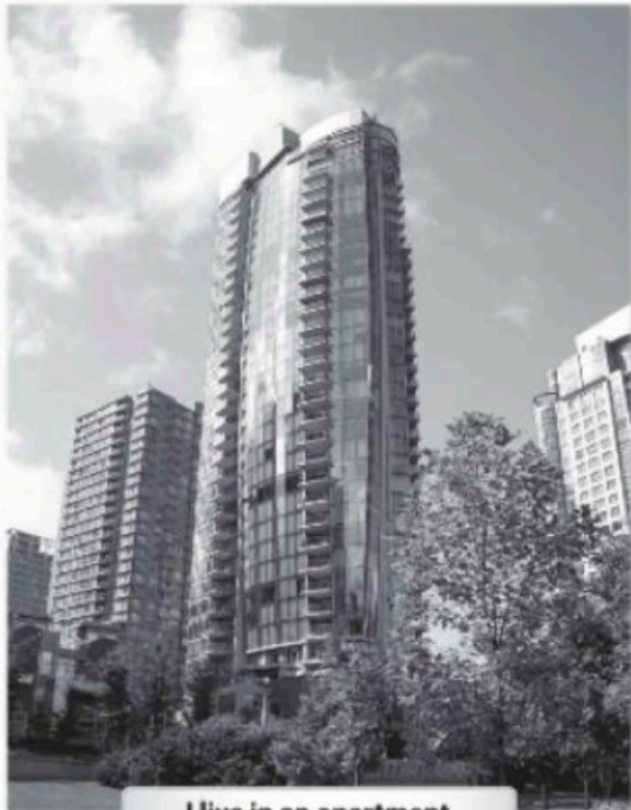
I live in an apartment.