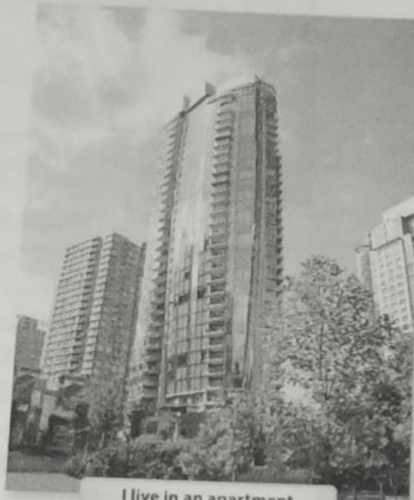
I live in an apartment.