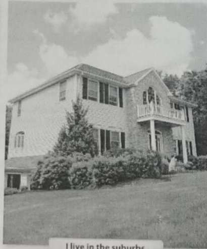
I live in the suburbs.

B Correct the false statements in part A.