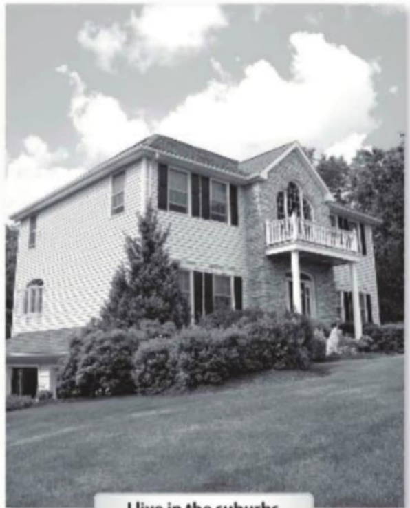
I live in the suburbs.

B Correct the false statements in part A.