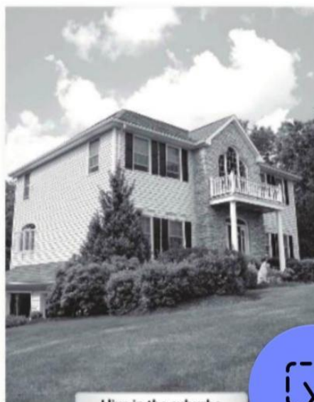
I live in the suburbs.