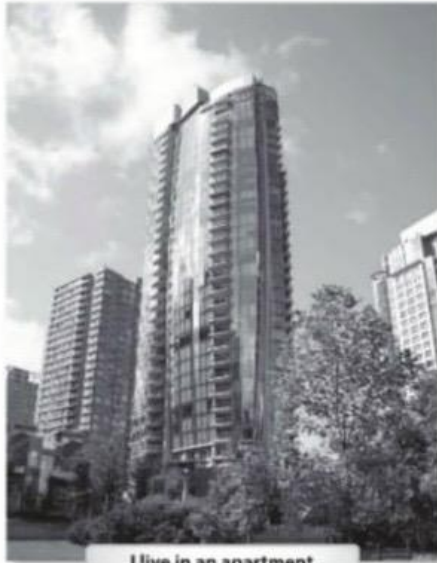
I live in an apartment.