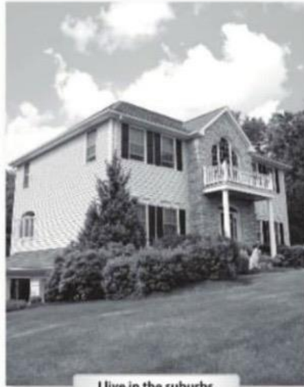
I live in the suburbs.

B Correct the false statements in part A.