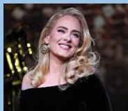
ADELE LAURIE BLUE ADKINS