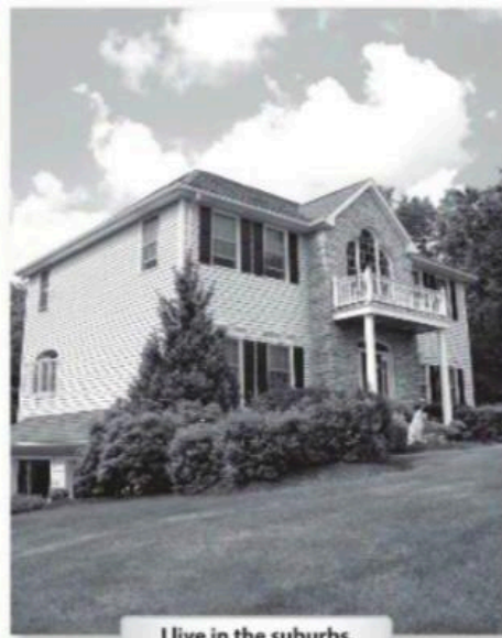
I live in the suburbs.

B Correct the false statements in part A.