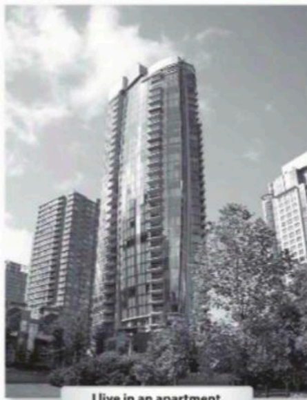
I live in an apartment.