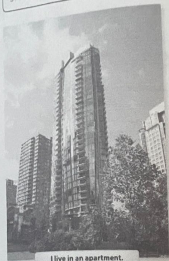
I live in an apartment.