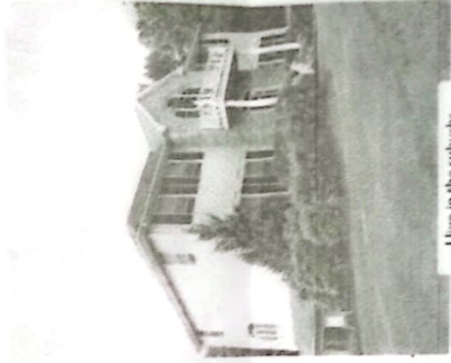
I live in the suburbs.

B Correct the false statements in part A.