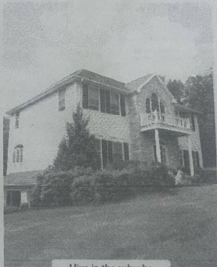
I live in the suburbs.

B Correct the false statements in part A.