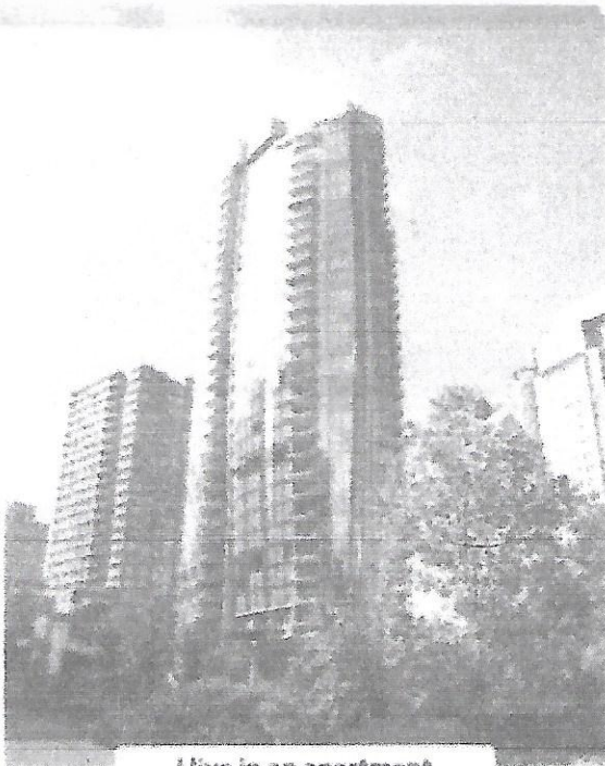
I live in an apartment.