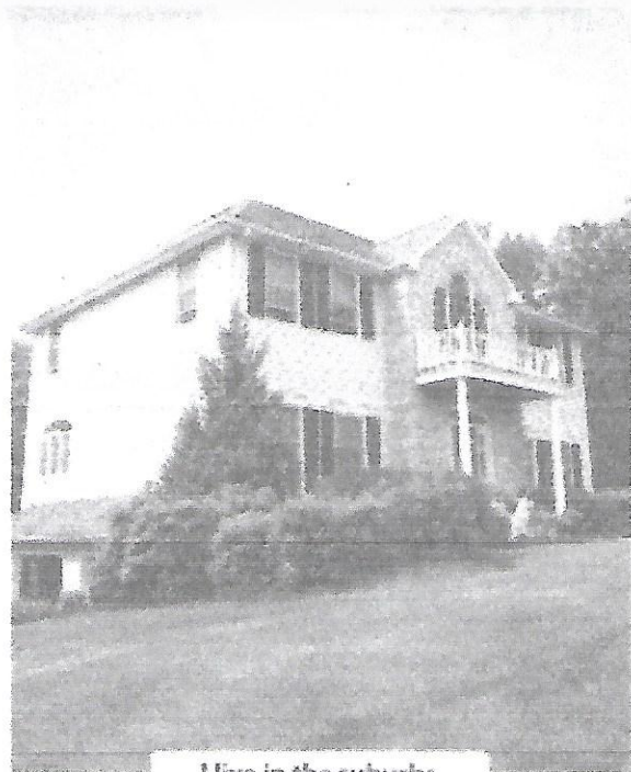
I live in the suburbs.

B Correct the false statements in part A.