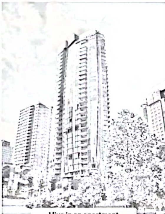
I live in an apartment.