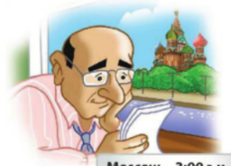
Moscow 3:00 P.M.

What are Jim and Ann doing? It's noon, so they're eating lunch.