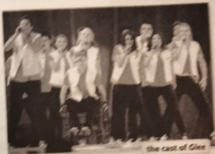
the cast of Glee