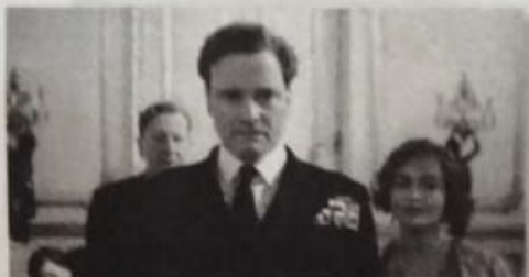
3. Colin Firth is an actor