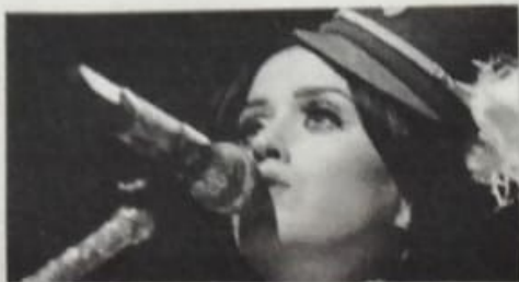
1. Katy Perry is a singer