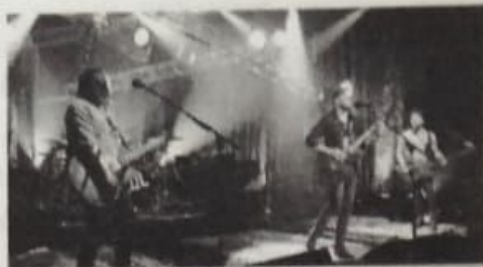
2. The Kings of Leon are a rock band