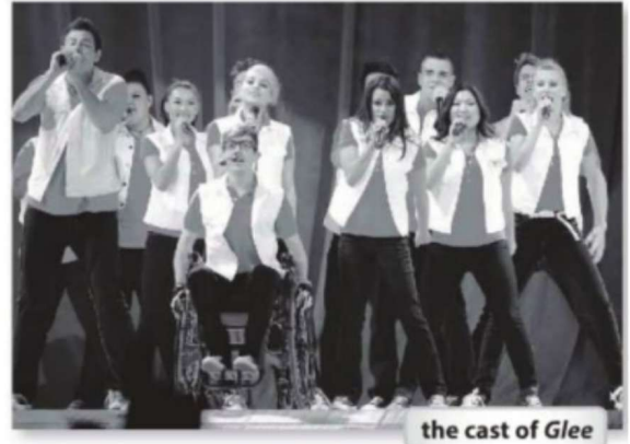
the cast of Glee