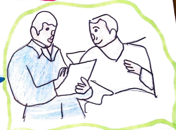
He's asking you how you feel