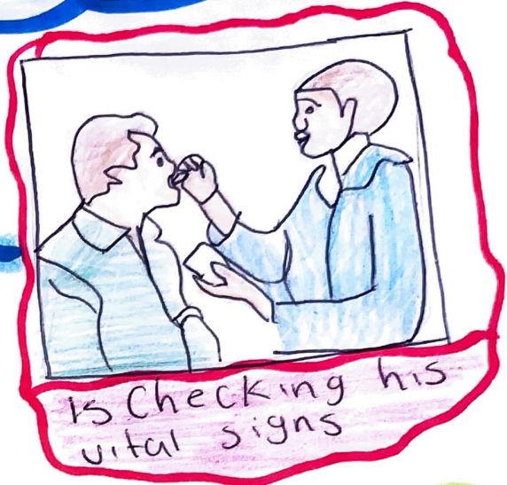
is checking his vital signs