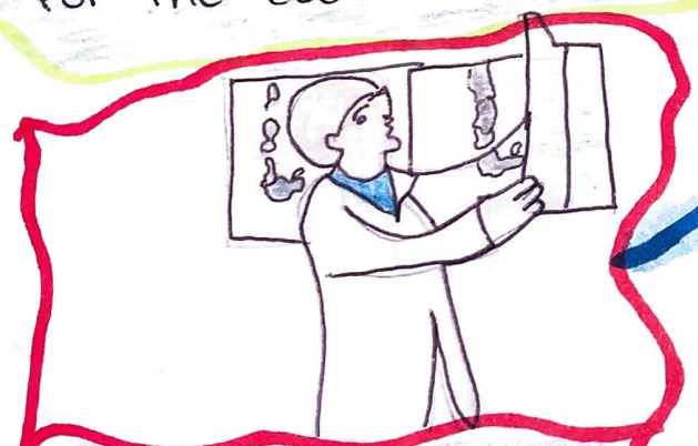
Checking a person's x-ray