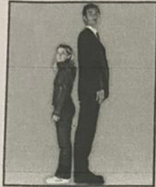
1. short 2. tall

a) 1.33 Read and listen. Then listen again and repeat.