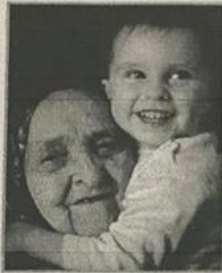
3. old 4. young