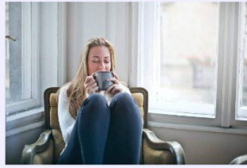
Try to relax.