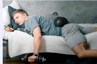
Don't exercise today or tomorrow.