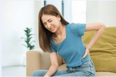
She has a backache.