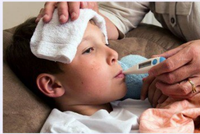
He has a fever.