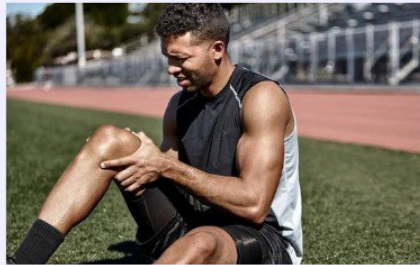
He has a sore muscles.