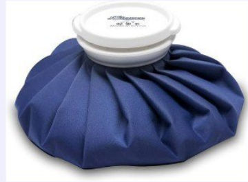
Take a ice pack.