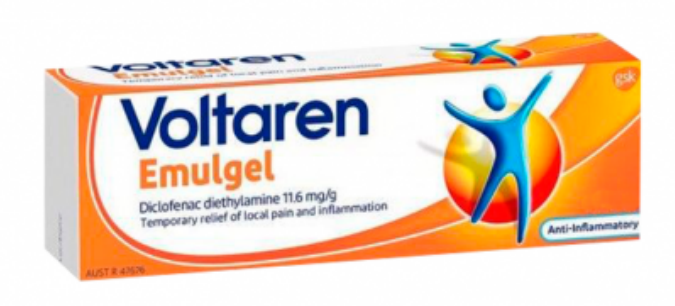
have feet ache. Apply cream.