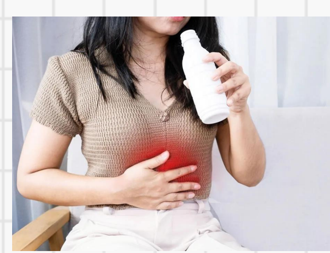
I have a stomachache. Take an antacid.