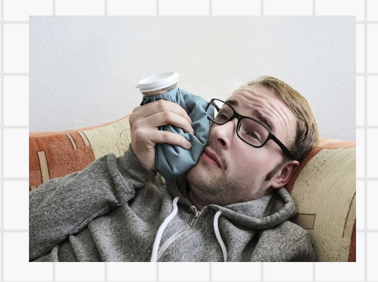
He has a toothache. Use an ice pack.