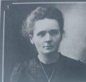
Marie Curie, scientist (1867-1934) • born in Poland • won Nobel Prizes in 1903 and 1911