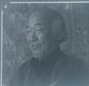
Pat Morita, actor (1932-2005) • born in the U.S. • was in the movie The Karate Kid , 1984