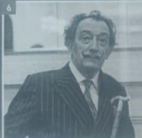
Salvador Dalí, artist (1904-1989) • born in Spain • painted The Persistence of Memory , 1931