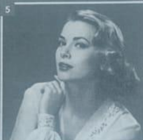
Grace Kelly, actress (1929-1982) • born in the U.S. • married Prince Rainier III of Monaco, 1956