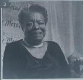
Maya Angelou, author (1928-2014) • born in the U.S. • wrote I Know Why the Caged Bird Sings , 1969