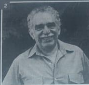
Gabriel García Márquez, author (1927-2014) • born in Colombia • wrote One Hundred Years of Solitude , 1967