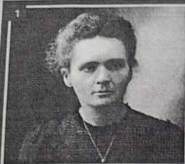
1 Marie Curie, scientist (1867–1934)