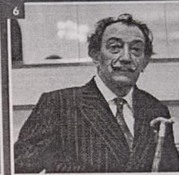
6 Salvador Dalí, artist (1904–1989)