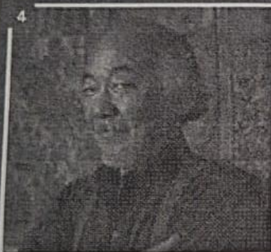
4 Pat Morita, actor (1932–2005)