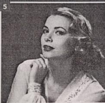
5 Grace Kelly, actress (1929–1982)