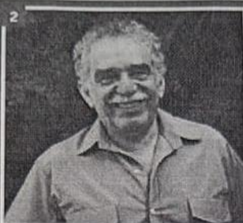
2 Gabriel García Márquez, author (1927–2014)