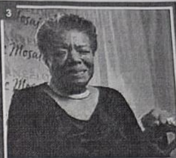
3 Maya Angelou, author (1928–2014)