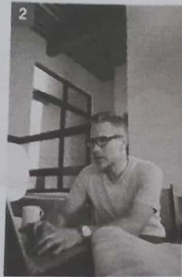
answer email responder