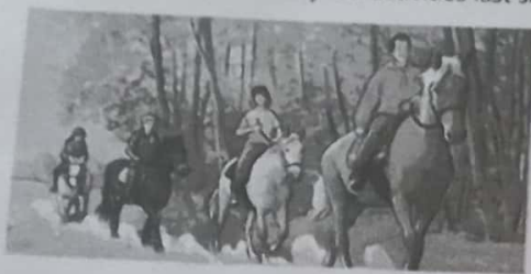
1. They rode horses.

A The Johnson family did many fun activities last summer. Write sentences about them.