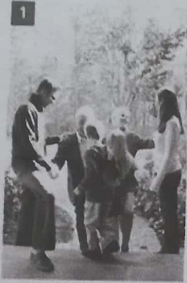
visit relatives familia

A What did these people do last Saturday? Write sentences.