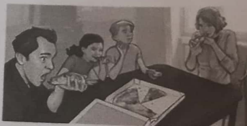
4. They ate pizza