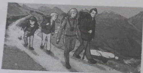
3. They walked in the camp