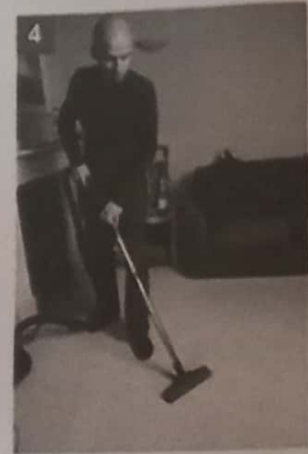
clean the house limpiar