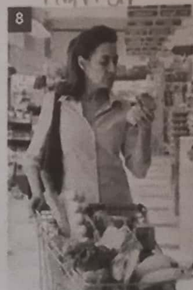
go grocery shopping ir a comprar cosas