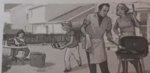
2. They cooked roast meat