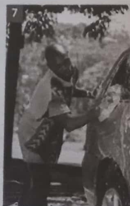
wash the car