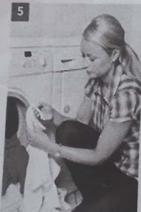
do laundry ropa sucia