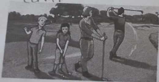
5. They played golf