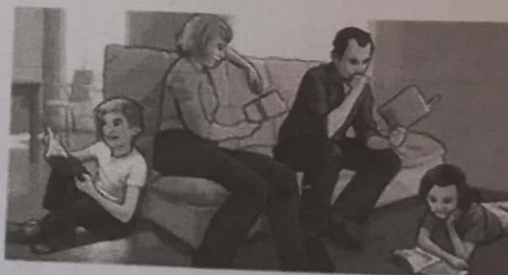
6. They read a books