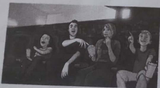
7. They watched movie.