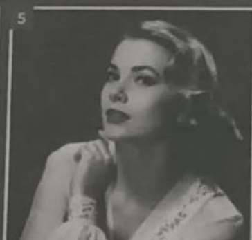
Grace Kelly, actress (1929–1982)