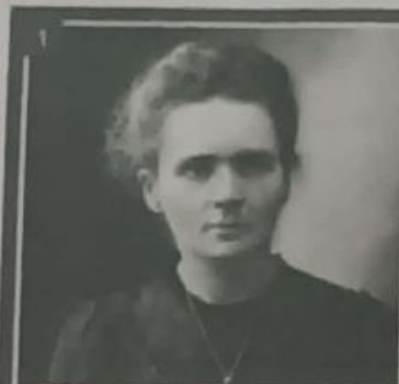
Marie Curie, scientist (1867–1934)