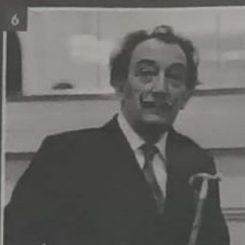
Salvador Dali, artist (1904–1989)