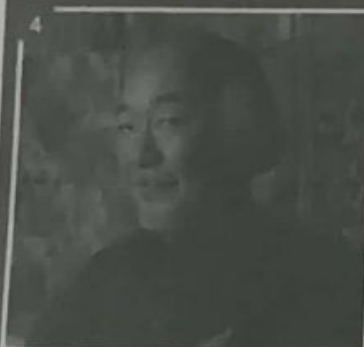
Pat Morita, actor (1932–2005)