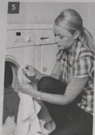
5 do laundry lavar ropa sucia