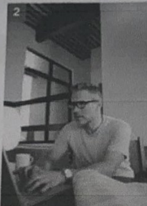
2 answer email responder email