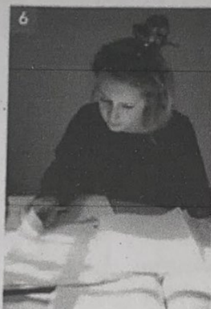
6 study estudiar