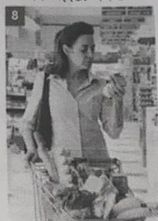
8 go grocery shopping hacer compras