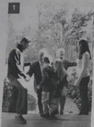
1 visit relatives visitar familiares

A What did these people do last Saturday? Write sentences.