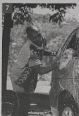
7 wash the car lavar carro