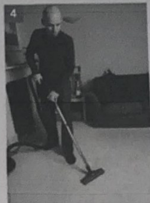
4 clean the house limpiar la casa