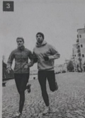
3 exercise ejercicio