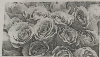
5. Valentine's Day

I going to wear special clothes I am going to watch fireworks I am going to eat special food