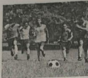
2. They're going to play soccer.