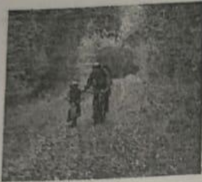
1. They're going to go bike riding.

A What are these people going to do next weekend? Write sentences.