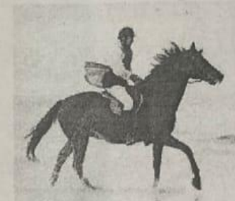
9. He's going to ride horse.

B What are you going to do next weekend? How about your family and friends? Write sentences.