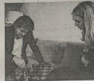
6. They are going to play chess.