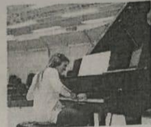
3. She's going to play the piano.