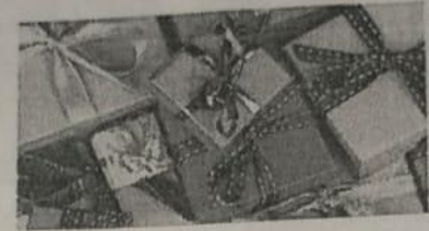
2. Your best friend's birthday

I'm not going to have a party. I'm going to go to a restaurant with my friends, but we're not going to stay out late.