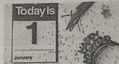
4. New Year's Day

I am going to sing songs I am going to play music I am going to stay out late