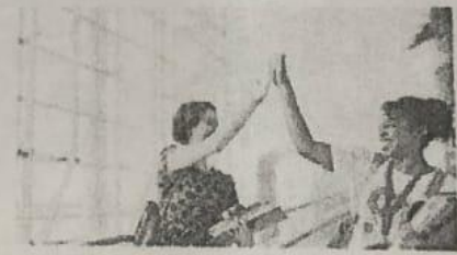
6. The last day of class

I am going to give gifts I am going to go to a restaurant I am going to go out with friends