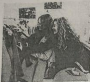
4. They're going to shop.