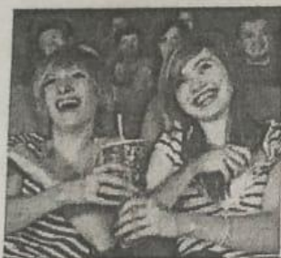
7. They're going to cinema.