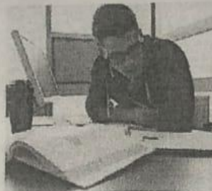
5. He's going to study.