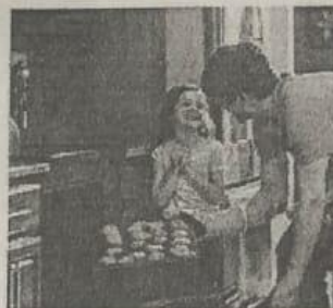
8. They're going to making bread.