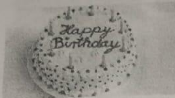
1. Your next birthday

I'm not going to have a party. I'm going to go to a restaurant with my friends, but we're not going to stay out late.