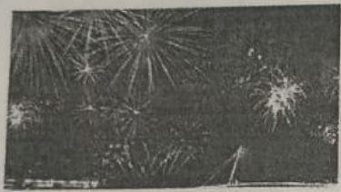
3. New Year's Eve Noche Vieja

I am going to dance I am going to have a party I am going to fireworks