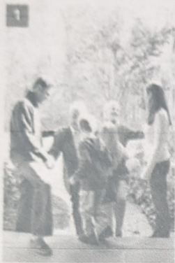
visit relatives visitar familia

A What did these people do last Saturday? Write sentences. que hicieron estas personas el sábado