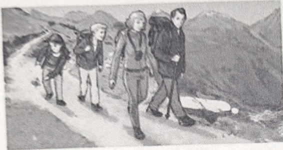
3. They walked Mountain