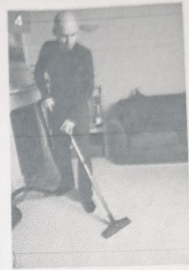
clean the house