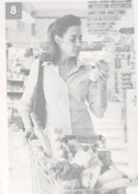
go grocery shopping