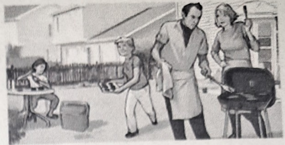
2. They cooked hamburgers