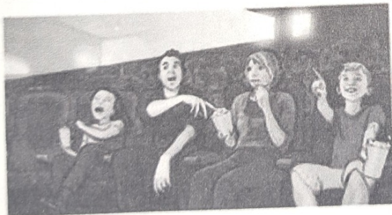
7. They watched movie cinema