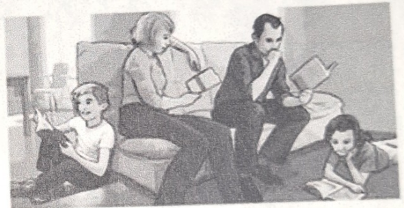
6. They read books