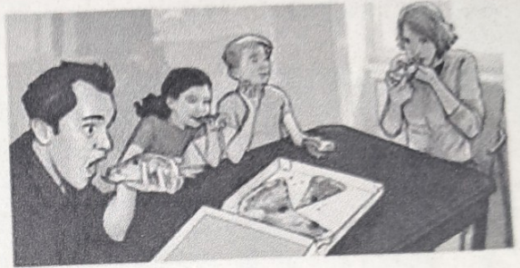
4. They ate pizza