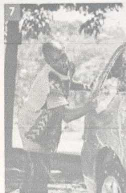
wash the car