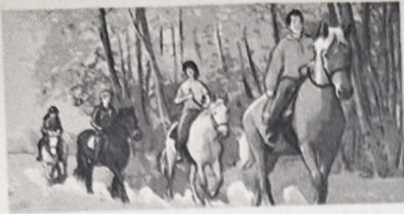
1. They rode horses.

A The Johnson family did many fun activities last summer. Write sentences about them.