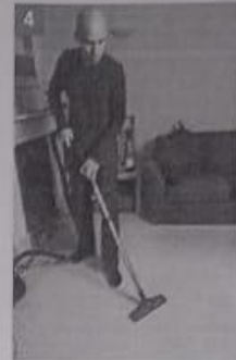
clean the house