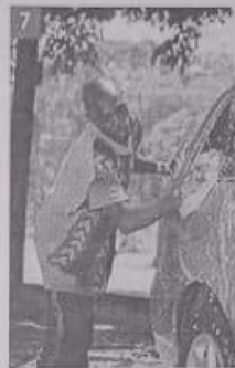
wash the car