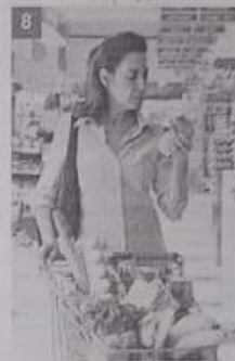
go grocery shopping