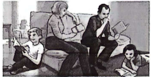
6. They read books