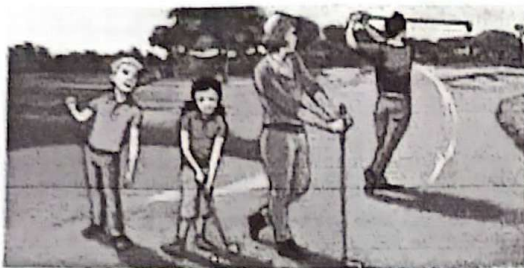
5. They played golf