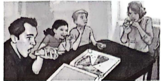
4. They eat pizza