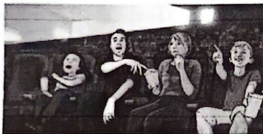
7. They were the cinema