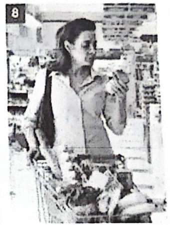
go grocery shopping