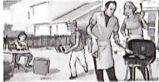
2. They roasted meat