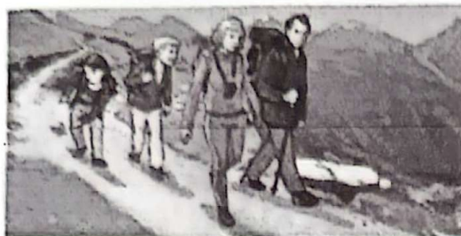
3. They went up mountain