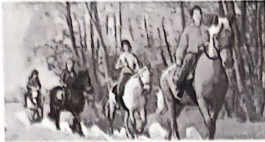
1. They rode horses.