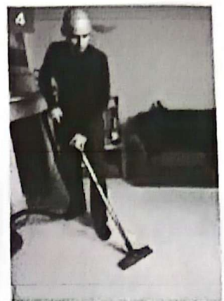
clean the house