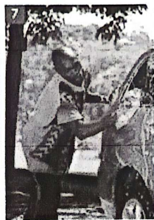
wash the car