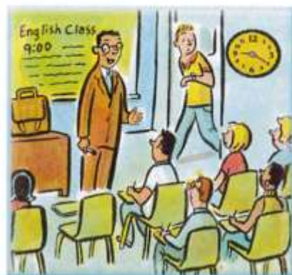
3. He's late