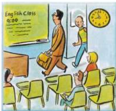
2. They're on time