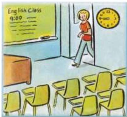
1. She's early.