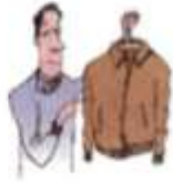
2. This Jacket