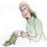
6. These high heels