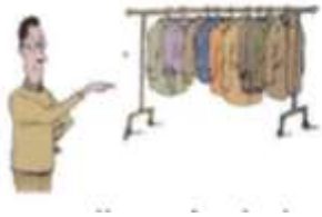
1. Those jackets

Exercise 2. Look at the pictures. "Write "this", "that", "these", or "those" and the name of the clothes.