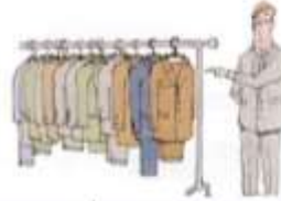
7. These suits