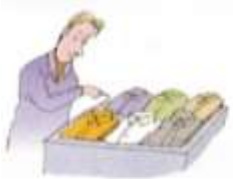
5. These shirts