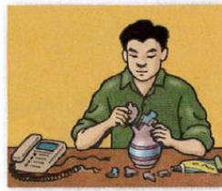
12. fix things

Exercise 1. Translate to Spanish the vocabulary above. Traduce al español el vocabulario de arriba.