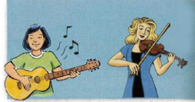
4. play the guitar/ the violin