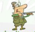
clay (target) shooting