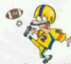
football American football