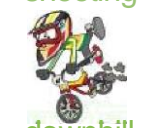
downhill mountain biking