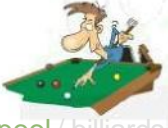
pool / billiards