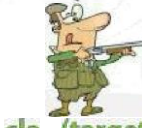
cla (target) shooting