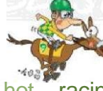
hot air racing