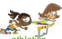
athletics (track and field)