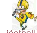
-iéotball American football