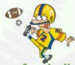
football American football