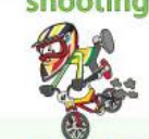
downhill mountain biking