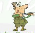
clay (target) shooting