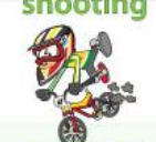
downhill mountain biking