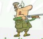
clay (target) shooting