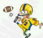
football American football