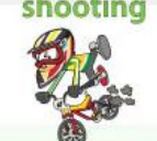
downhill mountain biking