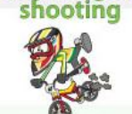
downhill mountain biking