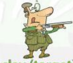
clay (target) shooting