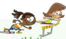
athletics (track and field)