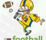
football American football