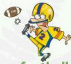
football American football