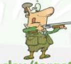
clay (target) shooting