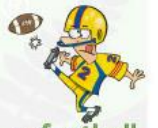
football American football