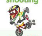
downhill mountain biking