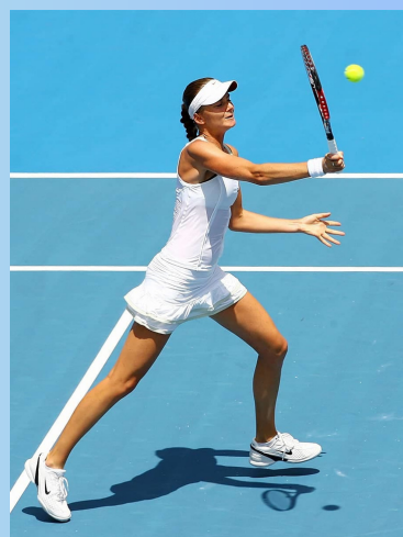
Tennis / Tenis