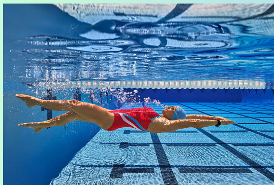
Swimming / Natación