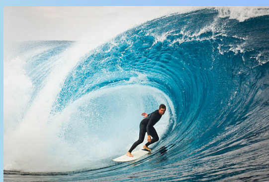
Surfing / Surf