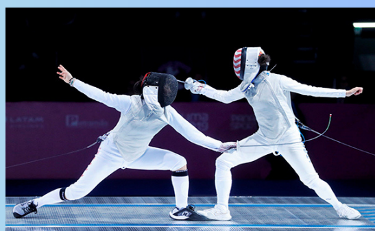
Fencing / Esgrima