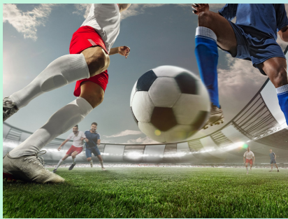
Soccer / futbol