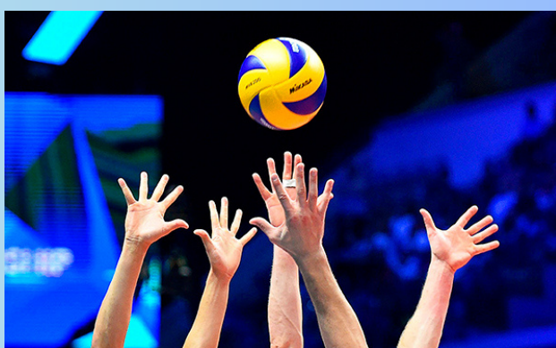
Volleyball / Voleibol