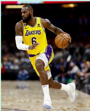
Basketball / Baloncesto