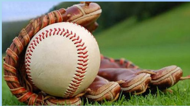
Baseball / Béisbol