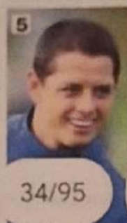
5 Javier Hernández