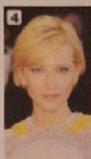
4 Cate Blanchett