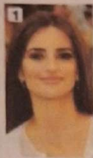
1 Penelope Cruz

A Where are these people from? Check (✓) your guesses.