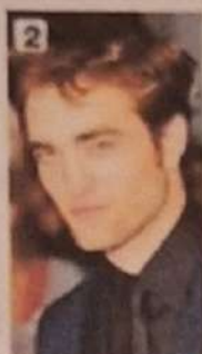
2 Robert Pattinson