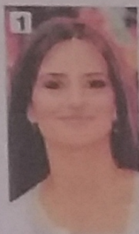
1 Penelope Cruz

A Where are these people from? Check (✓) your guesses.