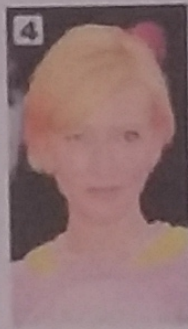
4 Cate Blanchett