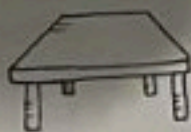
Desk [désk] Escritorio