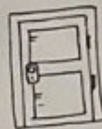
Puerta [dóor] Puerta